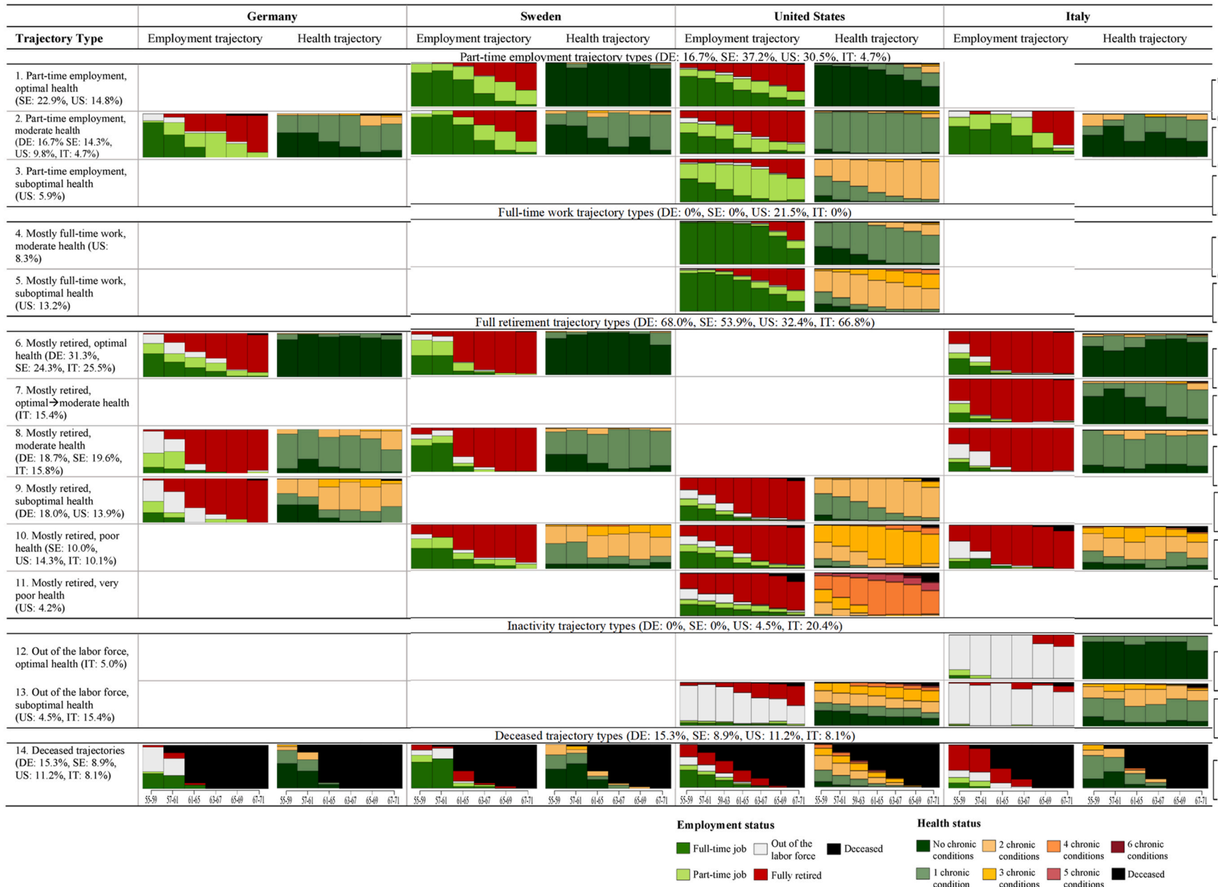
Fig. 1b. Interlocked employment and health trajectories of individuals aged 55–59 Note: DE = Germany; SE = Sweden; US = United States; IT = Italy.