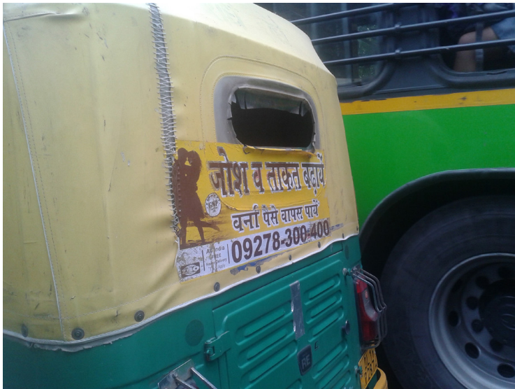
An autorickshaw in Delhi advertising products that will "increase your youth and strength" or will give "your money back."

in Kerala, the hakim draws from both art and science. Autorickshaws advertise hakim 's remedies for lost "vigour" and "strength," while clinics promise to cure everything from homosexuality to erectile dysfunction. All cures offered are for guptrog or secret maladies. Such a secret sounds like Foucault's idea of the ars erotica —an art into which the disciple has to be initiated. But the category of guptrog also partakes of the scientia sexualis in which sex is shrouded in secrecy and becomes a thing to be cured rather than celebrated. From Vatsyayana to the hakim , then, Indian sexology has been steeped in categorical multiplicity.