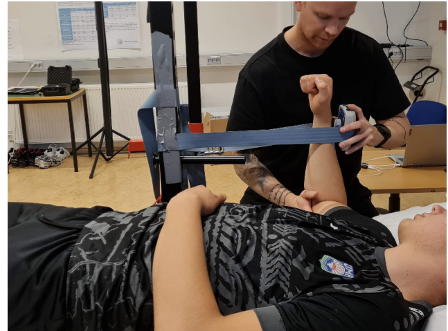
Figure 4. Isometric external rotation shoulder strength testing

An externally fixed handheld dynamometer (HHD) (Lafayette Instruments, USA) was used to measure maximal isometric IR and ER strength of the dominant shoulder in a supine position, with the shoulder in 90° abduction and 0° rotation (Figure 4). 8,26 A towel was placed under the distal end of humerus to keep the upper arm in the horizontal plane. Participants finished a standardized warm up routine and got one familiarization trial. 12 Participants were instructed to maintain stability in their torso, upper arm, and elbow and to avoid any substitution. They were given