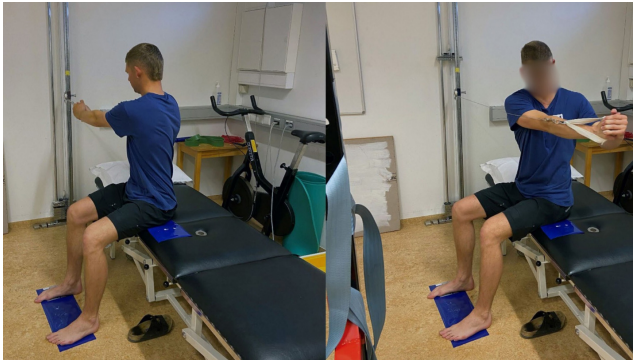
Figure 3. Seated trunk rotation power testing