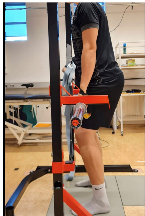
Figure 2. Isometric mid-thigh pull testing

Lower body strength was measured with the Isometric mid-thigh pull (IMTP), a well-established and reliable test for lower body peak force measurements (Figure 2). 21 Peak force of the IMTP has been shown to correlate highly with one repetition maximum squat and deadlift, indicating its appropriateness for measuring lower body strength in laboratory settings. 22,23 Participants finished a standardized warm up routine and got three familiarization trials (at 50%, 75% and 90% subjective effort). During testing, knee and hip angles were standardized (between 125-145° and 140-145° respectively) as recommended by Comfort et al. 24 Participants held a 20 kg weightlifting bar in a fixed position with their hands strapped to the bar with weightlifting straps to minimize the effect of their grip strength, while positioned on a force plate (AMTI, Watertown, Massachusetts, USA) to measure the vertical component of the ground reaction force, sampling at 100 Hz. Participants were encouraged to push as hard and as fast as possible