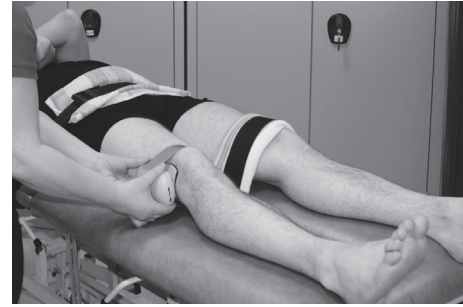
FIGURE 1: Isometric strength testing of hip abductors. Straps at pelvis and contralateral limb, as well as fixating hand-held dynamometer.

Data for this cross-sectional laboratory study were collected during baseline measurements of patients who had been referred by orthopedic specialists for a fitting and trial treatment with an unloader (valgus) brace [21]. Due to limited number of female patients at the clinic who were inclined to try an unloader brace, a decision was made to include only males in this study. Seventeen male patients (aged 40–60 years) with confirmed medial knee OA, Kellgren Lawrence (KL) grade 2 or 3 radiographic changes [22], and clinical history of pain and functional impairments fulfilled the inclusion criteria. In cases where bilateral radiographic knee OA was diagnosed, the more symptomatic knee denoted the affected one. Patients were excluded if they had joint replacement surgery, periarticular fracture, osteotomy, knee ligament reconstruction, or arthroscopic surgery to any lower limb joint within 6 months of the study. Exclusion criteria also included radiologically confirmed OA in the ankle or hip joints, intra-articular corticosteroid or viscosupplementation injection to either knee joint within 3 months of study participation, or any musculoskeletal or neurological impairment, dermatological or circulatory problems in the lower extremities that might affect ambulation. Fourteen asymptomatic male subjects were recruited from the university community to serve as controls (CTRL) and were matched