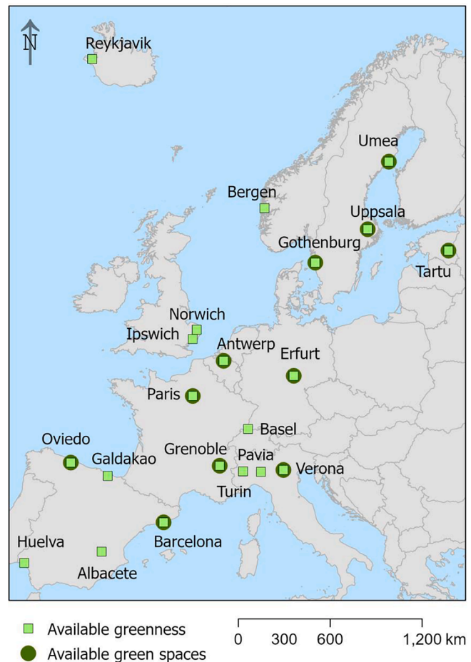
Fig. 1. Included study centers and availability of greenspace data across them.

FEV 1 and FVC repeatable to 150 mL from at least two of a maximum of five correct manoeuvres that met the recommendations of the American Thoracic Society and the European Respiratory Society (Miller et al., 2005) for repeatability, as well as the FEV 1 /FVC ratio, were used as the outcomes of interest. Four different models of spirometers were used across centers at ECRHS I and ECRHS II, while the same spirometer was used by all but two centers at ECRHS III (Table S1). Measurement bias due to the use of different spirometers had been corrected (Accordini et al., 2020; Bridevaux et al., 2015). All lung function measures were taken without bronchodilation.