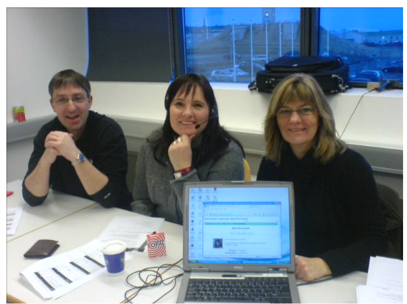
Figure 2. Group working in a campus session in Reykjavík with a group member in Florida (using Skype). January 2008.

Attendance in campus sessions is not required in the graduate program. However, graduate students are informed that if they miss sessions it is their own responsibility. It varies by teacher how and to what extend they accommodate the needs of those who do not attend the sessions. It is increasingly common to record sessions live and put the recordings online<sup>11</sup>. In courses I teach, I have experimented with keeping students connected through Skype or other software allowing sound chat and video broadcasting. Sometimes on my own computer or I have asked team members of those persons to keep them connected on their computer (see Figures 2 and 3).