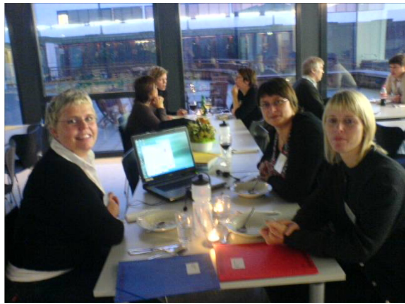
Figure 3. Group socializing during a campus session in Reykjavík with a group member in France (using Skype). September 2007.

In the undergraduate programs teachers can require attendance in courses they teach. However, information regarding mandatory attendance accidentally was left out of the curriculum guide for 2007 to 2008. Discussion recently on the staff postlist showed different views. People tended to agree that it could be necessary to have campus sessions in subjects requiring hands-on experiences including arts and crafts. Faculty members who were critical about mandatory attandance emphasized flexibility, student responsibility, teachers' responsibility to make campus experiences worthwhile, and that attendance might be preferrable but not necessary in many subjects.