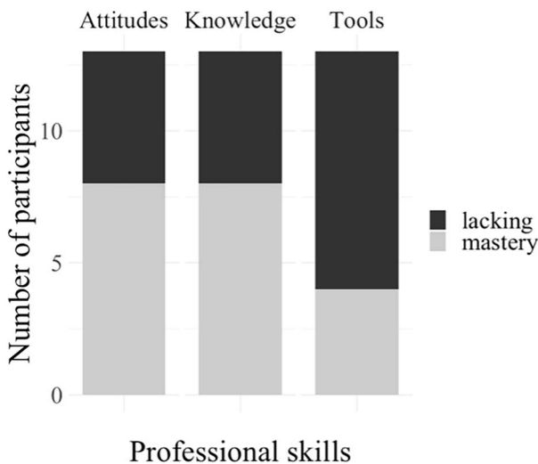
Figure 2. SLPs feeling about skills to support families of DMLs.

reported a lack of tools and strategies (see Figure 2). The two SLPs with less than five years of experience ( n=2 ) reported their skills in all areas were lacking. Beyond five years of clinical experience, there was no clear relationship between years of experience and feelings of mastery.